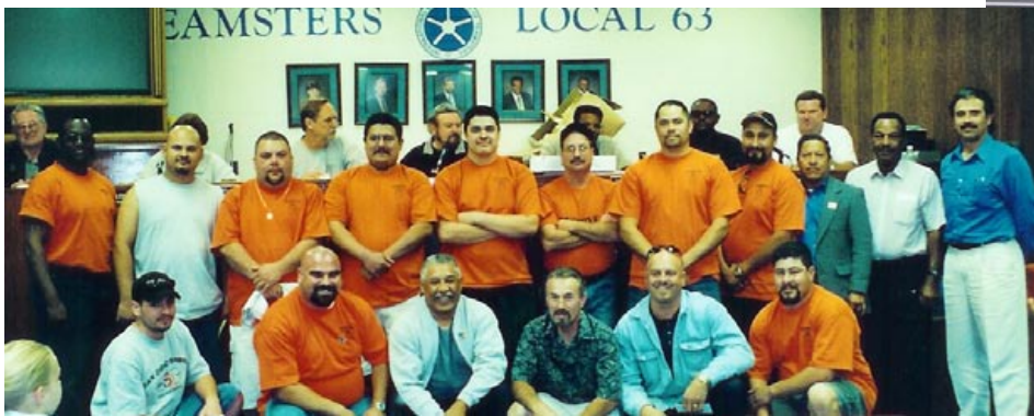
Budway members from the original contract