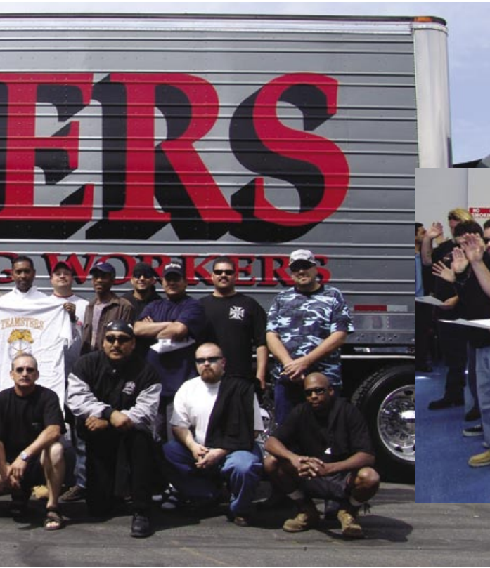
...ing where they took their Teamster oath. All ...dge to the union as show at top right picture.