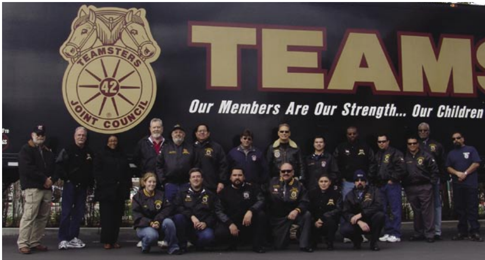
Members from several locals showed up to support Local 495