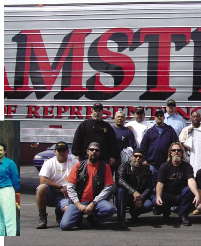
Budway members at a recent membership meeting. Teamsters were encouraged to renew their plea